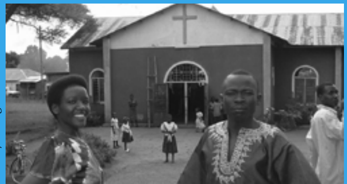
Sunday in Ngara

(a) in Suffolk, and (b) in Kagera? What is our responsibility towards them?