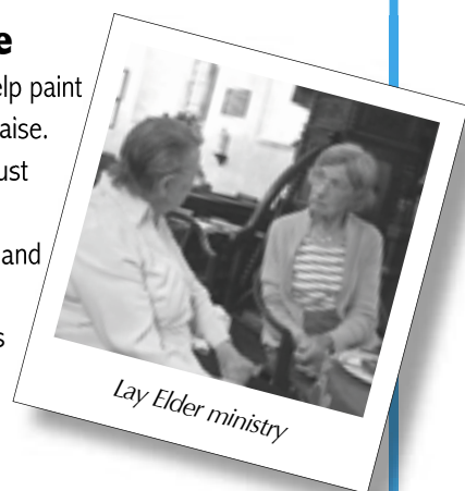
Lay Elder ministry

Village people want to belong to the Church – they help paint its fence, spring-clean, care for the churchyard, fundraise. They ask for prayer, and use the candle-stand – not just those who attend services. For our monthly Drop-In, Church becomes a welcoming Café with refreshments and a Fair Trade stall. Conversations abound with people aged a few weeks to 95 years. It opens doors so lives can be touched with the Light and Love of Christ.