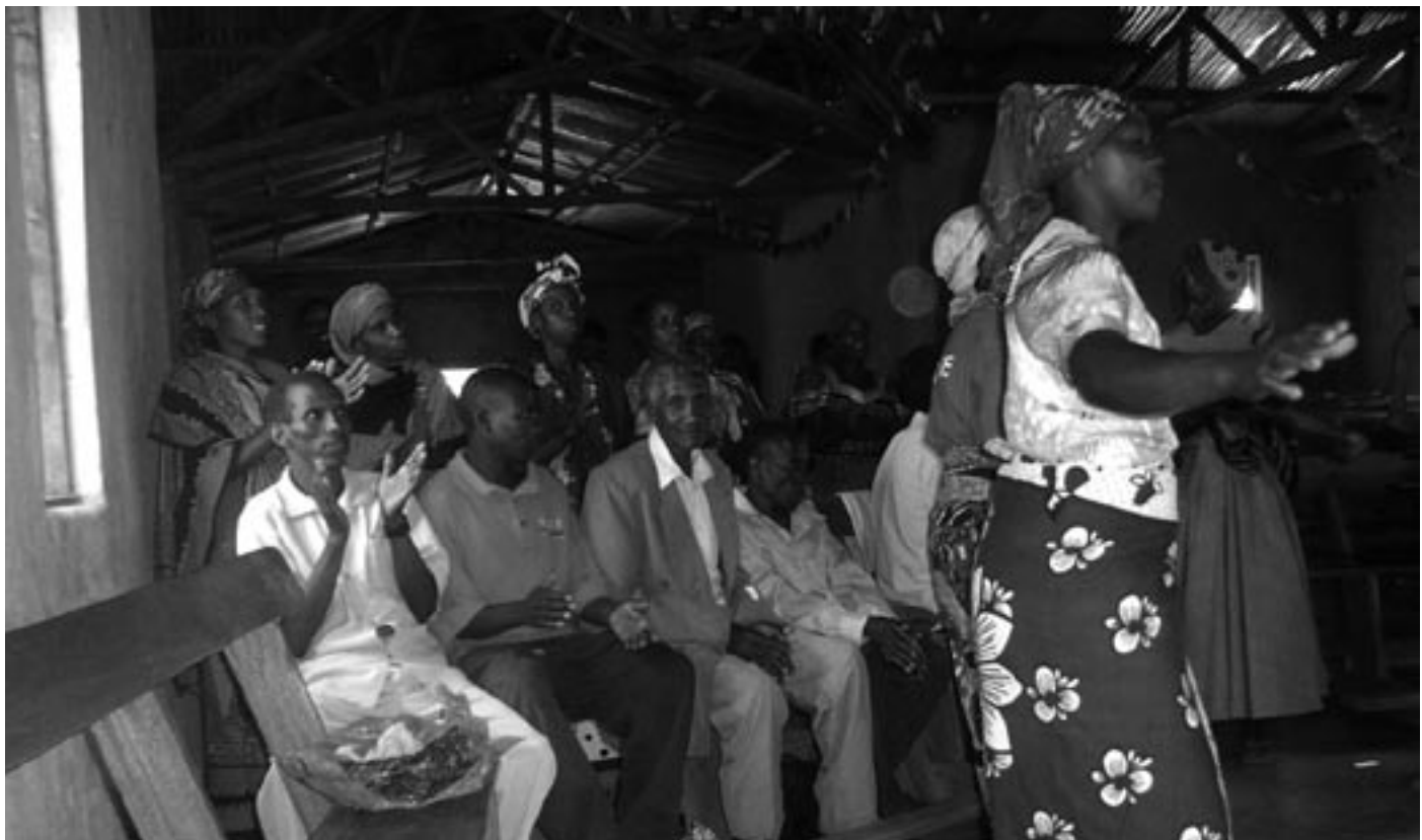
Training day for evangelists at Mabawe