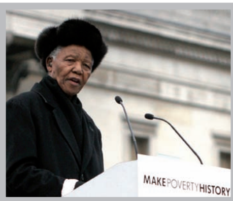
Nelson Mandela addressing the crowds in Trafalgar Square, 2005.

“Like slavery and apartheid, poverty is not natural. It is man-made, and can be overcome by the actions of human beings. ”